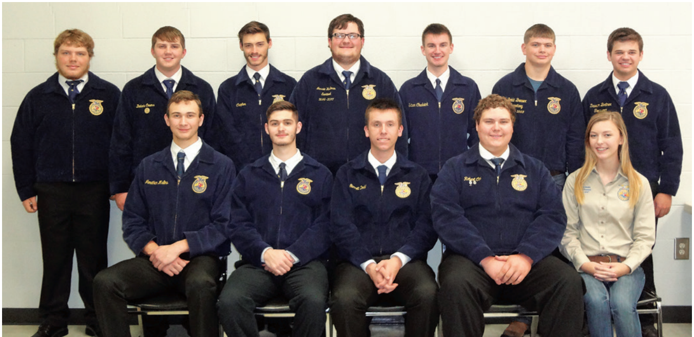
The North Region Area I EMC/FFA career development event was held on Nov. 15, 2016, at Amicalola EMC in Jasper. Students from 10 north Georgia high schools participated.